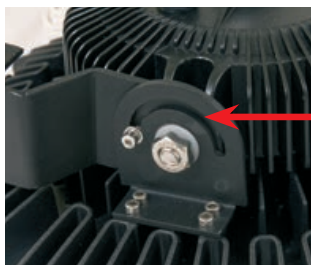
Inclination micro adjustment