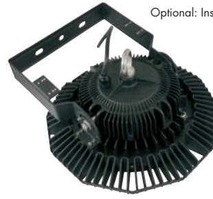
Optional: Installation bracket Part N°: BCBRACKEVO2N